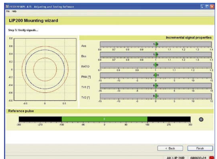
Commissioning using PWM 20 and ATS software